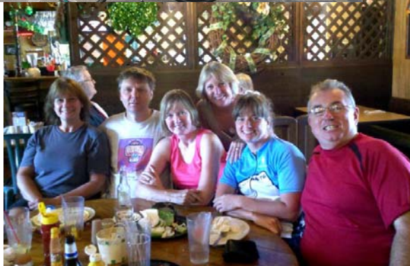
Happy Hour Friday 26 Bourbon Street