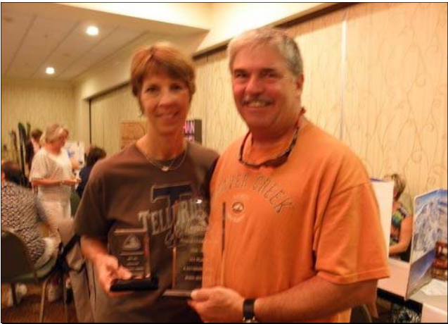
Finally... and the winners are...