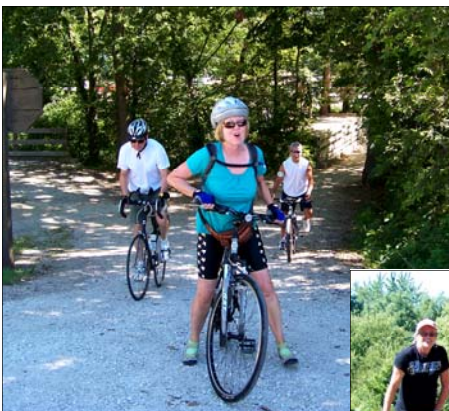
Channahon, I & M Canal 11 Riders Strong Saturday, August, 28